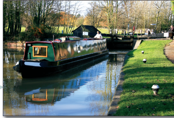
Grand Union Canal