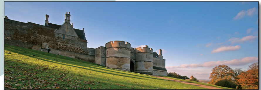
Rockingham Castle. Looking like every little boy's picture of a toy fort, Rockingham stands on the edge of an escarpment with stunning views across 5 counties, and it is easy to see why William the Conqueror chose the location to build a defensive castle in the East Midlands.