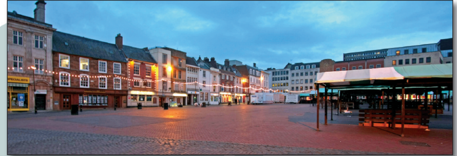
Northampton's market square is reputed to be the largest in the country and has existed as a trading place since 1235, when King Henry banned the selling of livestock from the nearby churchyard of All Hallows.