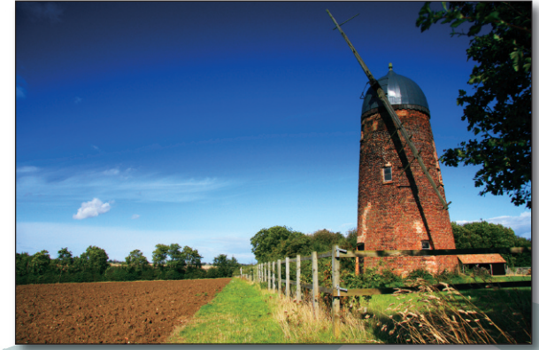
Windmill near Riseley