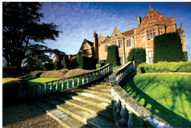
Towsey was built by the Raigley family and was visited by Queen Elizabeth I in 1575. Interestingly another monarch Charles I is known to have stayed and hosted at Towsey on the eve of the Battle of Naseby in 1645. The Raigley family were openly opposed to the unilateral power of the Monarch, but they were staying in London at the time and the reason was perhaps a Royalist, who had an eye to the future. Sully for him the King line...