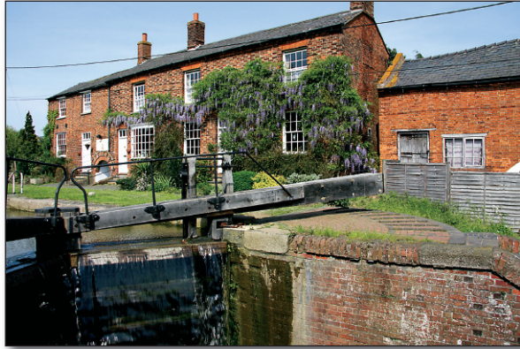
Canal Cottages at Whilton Locks